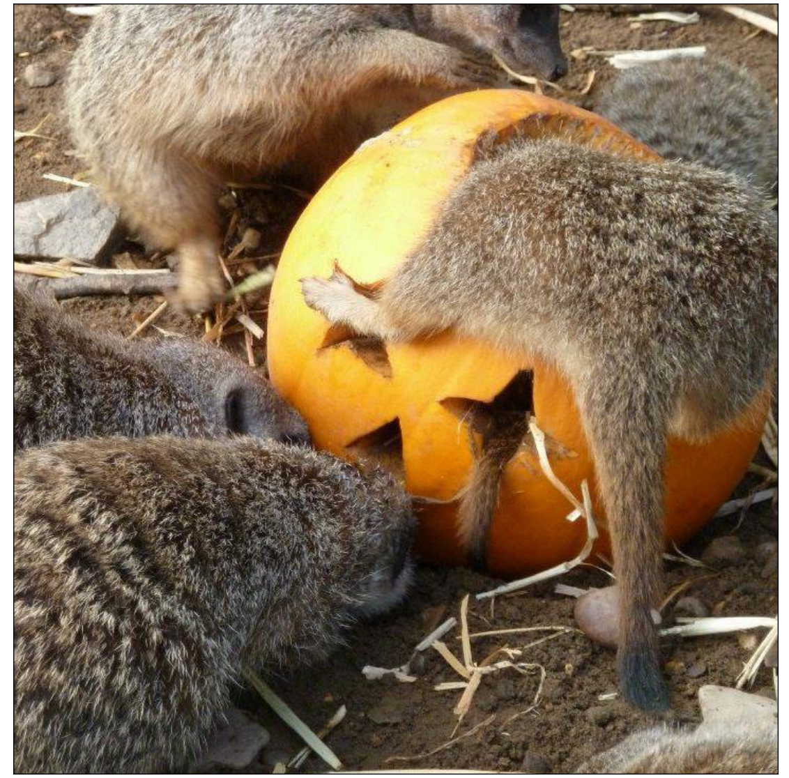
TASTY TREATS \dots Twycross Zoo will hold a pumpkin competition with the entries eventually being consumed by its meerkats

TWYCROSS Zoo is holding its Halloween Spooktacular this half term, with a host of scary celebrations set to take place.